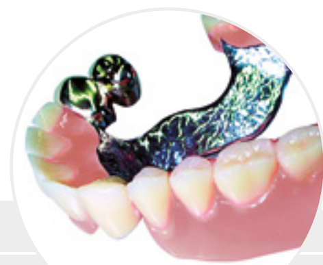
Framework with acrylic saddle